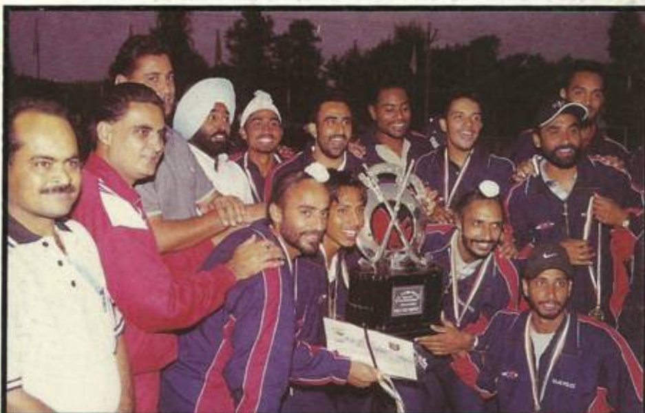
Jubilant Winners of the Championship -