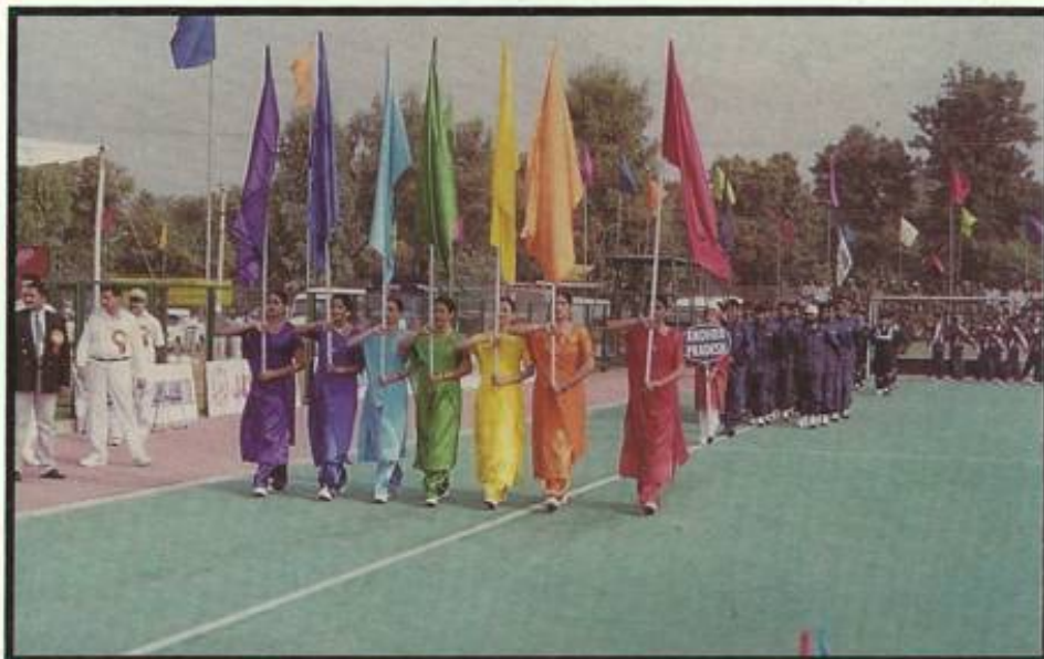
March-past of the Contengents of the participating teams