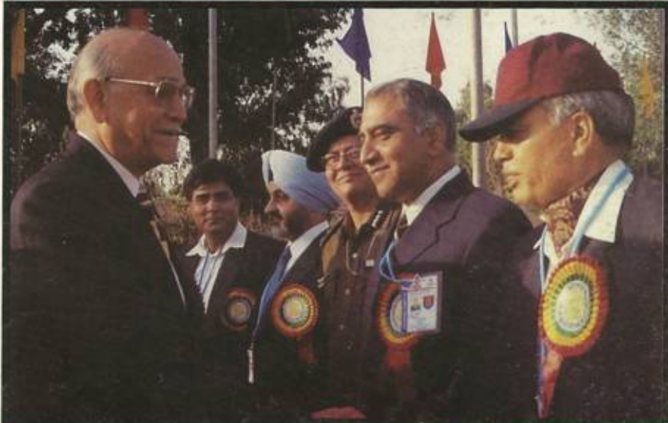
Introduction of Organisers with H E the Governer, J&K