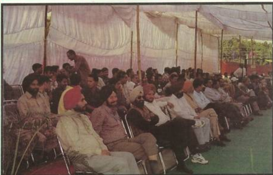
A cross section of the spectators at the final match.