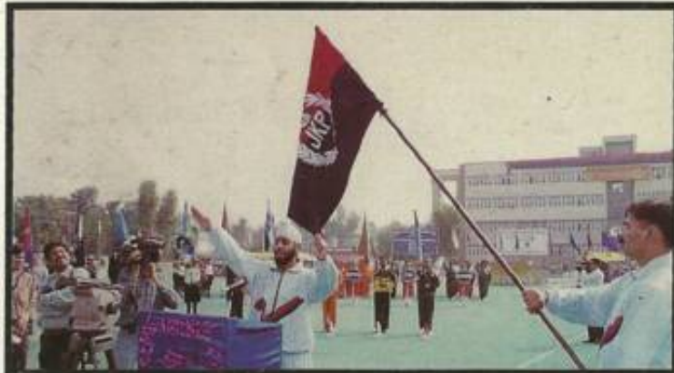
Oath taking ceremony at the inaugural function