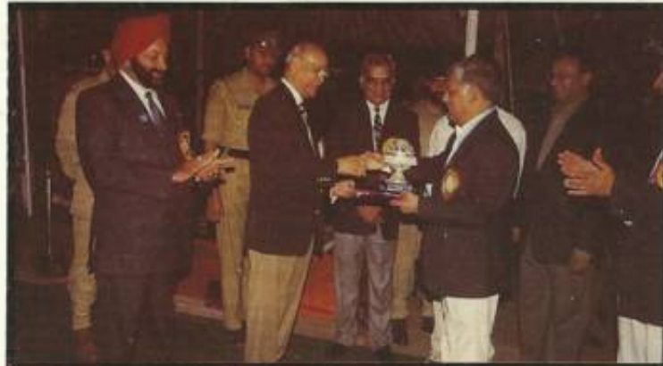
DGP, J&K, presenting a memento to HE the Governor, J&K, at the concluding function