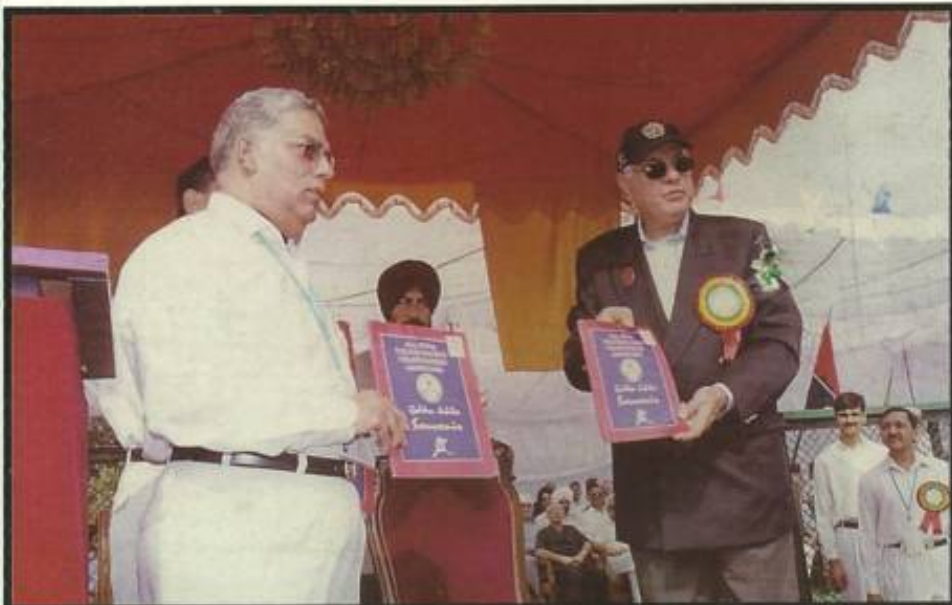
CM, J&K, releasing the souvenir at the inaugural function