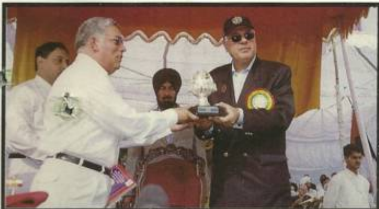
DGP, J&K, presenting a memento to CM, J&K