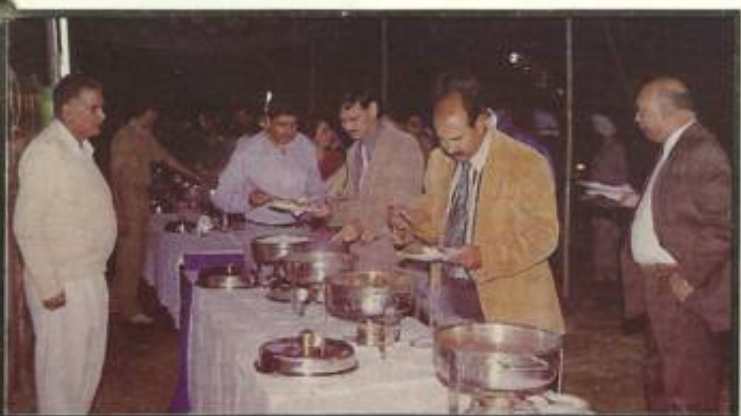
A "Bara Khana" at Police Stadium Gulshan Ground, Jammu, on Nov., 05.