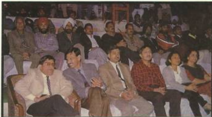
A cross section of the spectators at the cultural evening on Nov., 05