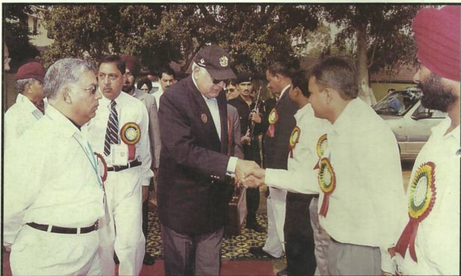
Dr. Farooq Abdullah, CM, J&K, introducing with the organisers and team managers at the inaugural function