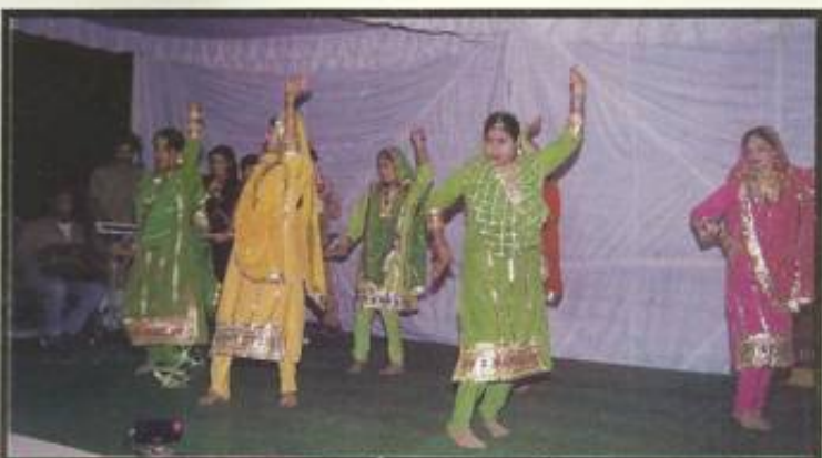
A view of the cultural evening