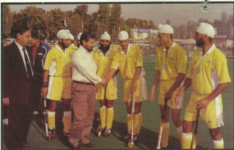
Organising Secretary introducing J&K Police XI with MOS (Hony) J&K.